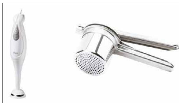
Figure 1 - Equipment for the reduction of size. Left side, equipment for friction process, Oster® brand immersion blender model M2609-13. Right side, equipment for compression process, Metaltex® brand potato press with a mesh size of 1 cm

After undergoing size reduction treatments, either compression or friction, all products were freeze-dried using the same processing conditions. The information related to this process is not disclosed due to its confidential nature of the company SioSi Alimentos, Mexico. The moisture content of the fresh avocados was 63.5 \pm 0.5\% , while the freeze-dried products had a moisture